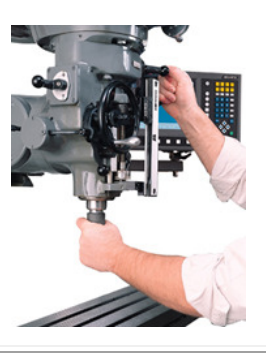
Step 3 Release the Air Lever Handle and Quill Lock