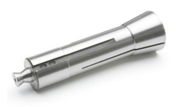
Mach-1 Collets use our patented pull stud design for greater speed and ease of insertion into the spindle.